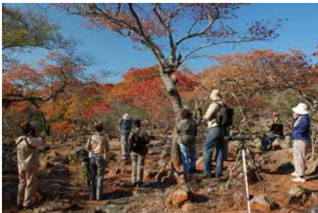
Birding in South Africa's only tract of Brachystegia Woodland