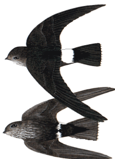
Mottled Spinetail distribution

Their habitat preference is determined by the presence of large hollow Baobab trees, in which they roost and nest. In South Africa, this species is considered as one of our rarest resident birds. The Segole Big Tree in north-eastern Venda, which is regarded as the largest Baobab in the world is home to approximately 12 pairs. Mottled Spinetails can also be seen in the far-northern Kruger National Park, where there are at least two known nesting sites.