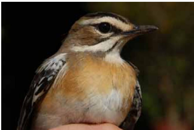
Beauty of the Bearded Scrub-robin can be appreciated up close

As for the birding (and atlassing), we totalled 97 for the lodge environs, and 143 for the weekend as a whole – not bad for winter (thanks to Joe, Derek and Samson)! Highlights included Gorgeous Bush Shrike popping out into the open after eluding us for a good half-hour, Osprey (apparently having sensibly given the long trek to Scotland a break), Half-collared Kingfisher , Grey Cuckooshrike , Bat Hawks near the nest, Crowned Eagle on the nest, Pink-throated Twinspot , Retz's and White-crested Helmet Shrike , Crested Guineafowl and African Wood Owl . Oh, and a Buff-spotted Flufftail that, as is usually the case, was a rumour to most of the group! And with Derek putting up his nets on the Sunday, we were able to get up close and personal to a variety of the more common species that nevertheless always impress with their beauty. This was a great event all round.